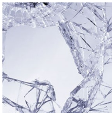
Broken Windows, Mirrors