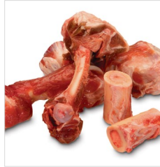
Meat Scraps and Bones