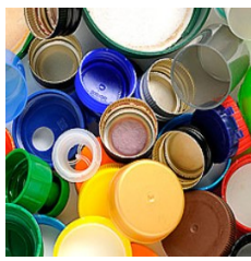
Drink Lids & Aerosol Nozzles