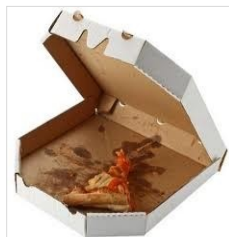
Pizza Box with food scraps