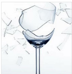
Broken Drinking Glasses