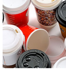
Disposable Coffee Cups